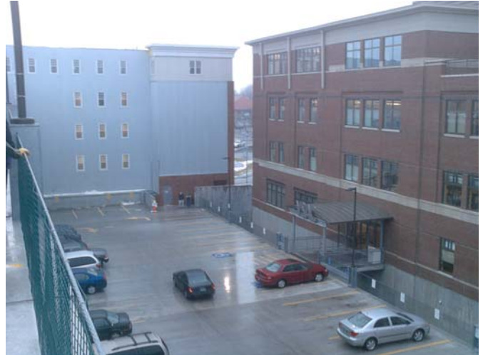
Picture taken from the top of garage looking at VSAC and Spinner place (inside wall).