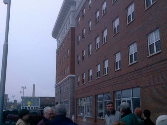
ASCE members in front of Spinner Place.

The dinner meeting was held at the Peking Duck in Winooski and the change of venue and dinner selection was well received.