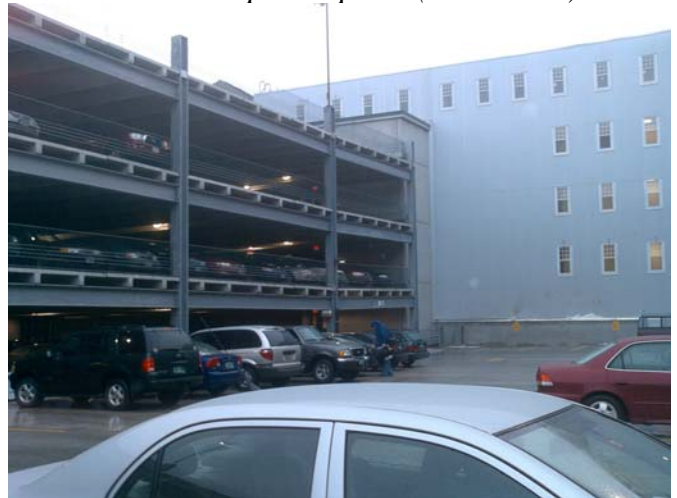
Picture taken from VSAC looking at garage and Spinner Place (inside wall).